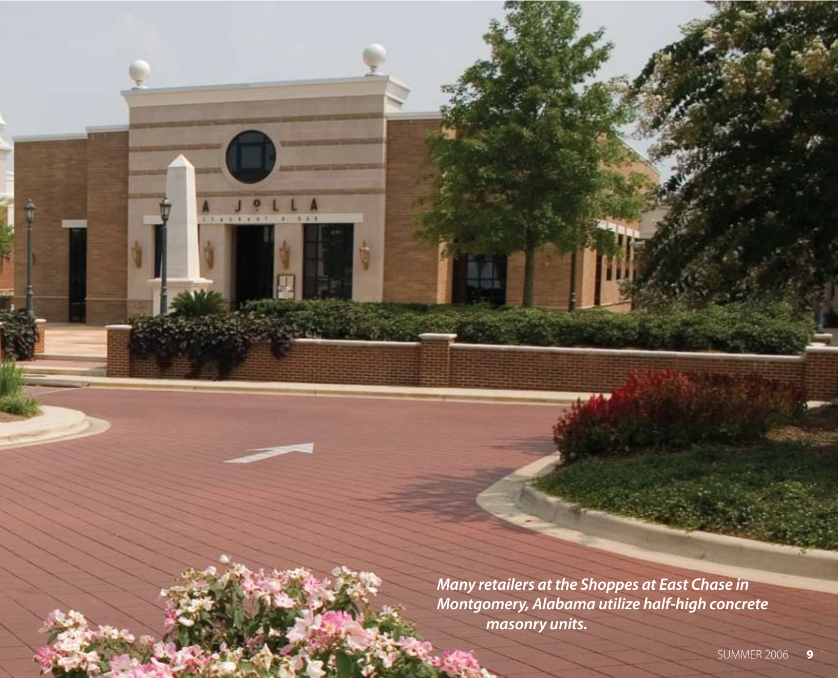
Many retailers at the Shoppes at East Chase in Montgomery, Alabama utilize half-high concrete masonry units.

When building a school, church, retail shopping center, or commercial center, the half-high is a flexible, functional product that adds beauty and value.